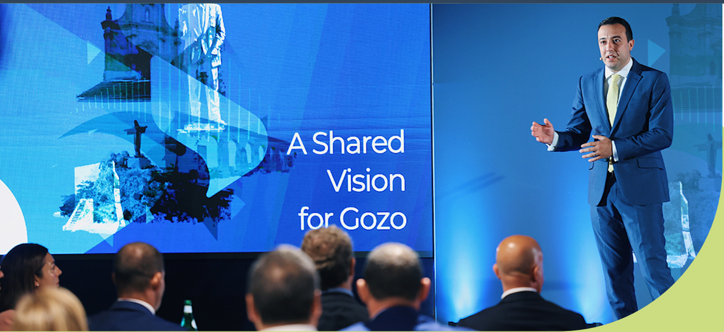
Minister Clint Camilleri giving a presentation during the launch of the Gozo Regional Development Strategy. ▲