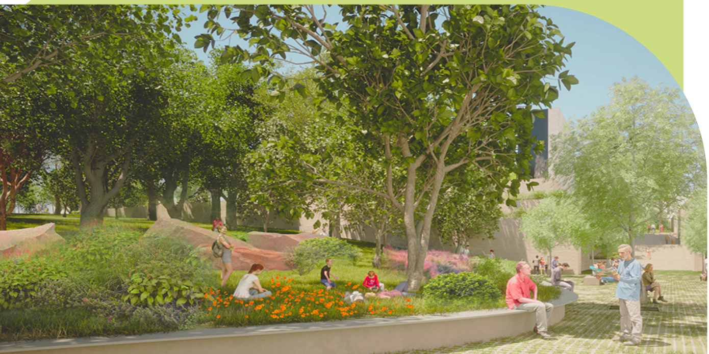
▼ An artist impression of the proposed park.

The concept proposal for Victoria urban upgrading forms part of GRDA's wider plan to design a long-term and holistic sustainable master plan for the island of Gozo.