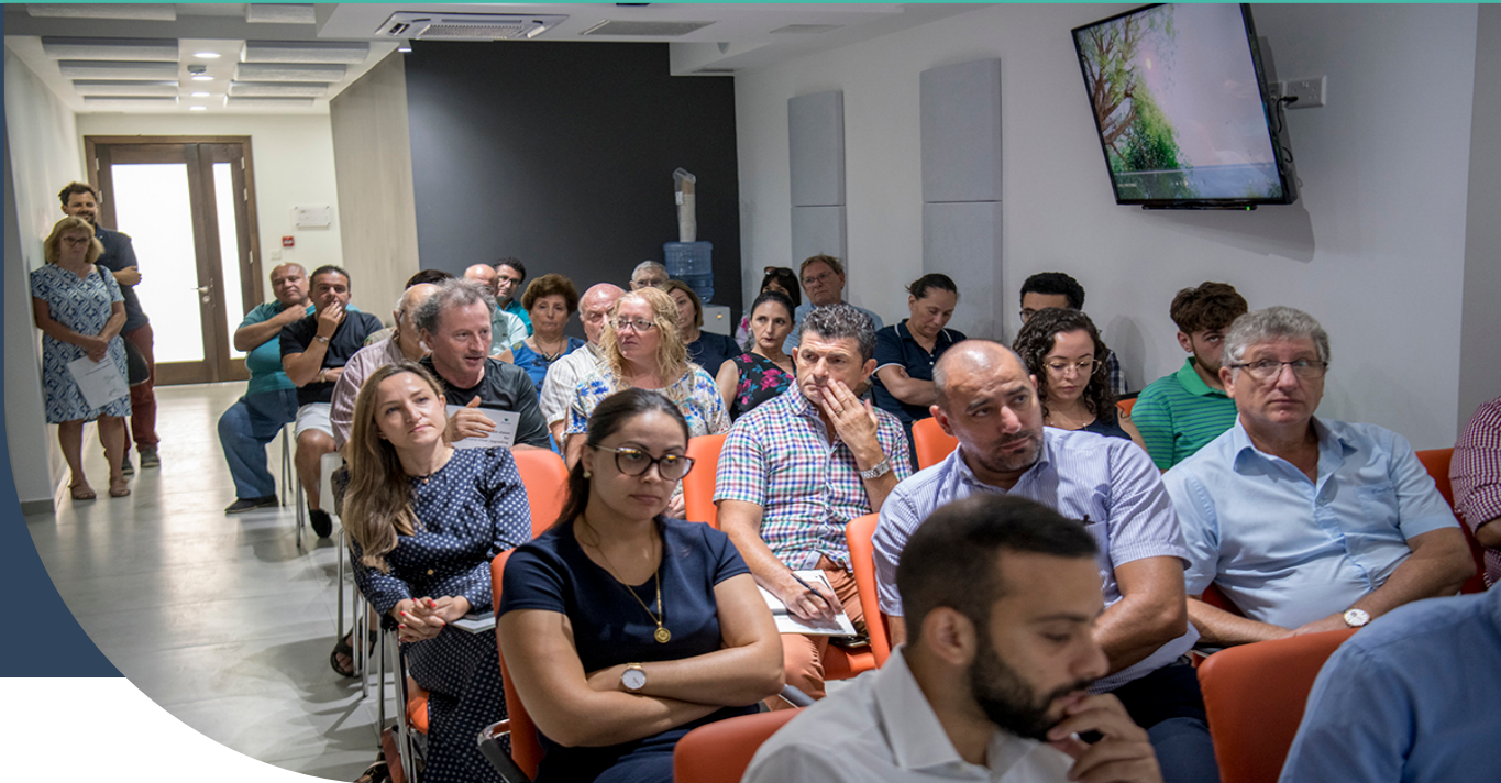
▲ GRDA Public Consultation Meeting in relation to GRDA's Victoria Urban Upgrade Proposal.

The GRDA held several meetings with relevant stakeholders together with a public consultation meeting. The Authority will be publishing an outcome statement in the coming weeks.